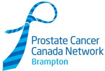
Photo-Sensitive & Prostate Cancer Canada

PhotoSensitive is teaming up with Prostate Cancer Canada to produce TIEd Together, a compelling black and white photo exhibition chronicling Canadians' experiences with prostate cancer.